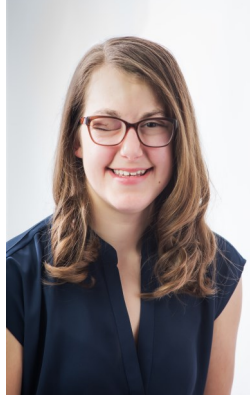
Hearing Loss Eyesight Loss