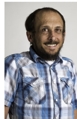
Cancer Tumors Walking Difficulty