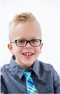
Brain Tumor Learning Disability Tumors on Skin