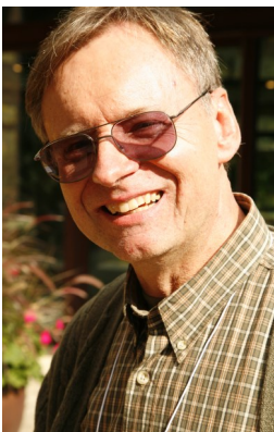
Total Hearing Loss Balance Issues

Neurofibromatosis (NF) is a complex, often devastating set of genetic disorders with possible complications throughout the entire body that may also hold the genetic mystery to a host of other human ailments. Affecting approximately 1 in 2,500 people or 2 million people worldwide, it appears equally in all races, ethnic groups, and genders. A common complication for a person with NF is the growth of tumors on the nerves anywhere in and on the body. There are currently several separate, distinct disorders classified as neurofibromatosis. This includes neurofibromatosis type 1 (NF1), neurofibromatosis type 2 (NF2), and schwannomatosis. Others are also being identified.