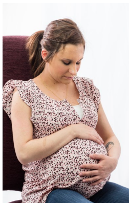
Mother & Child w/NF Pain Tumors