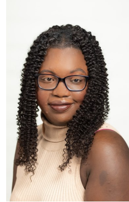
Brain Tumor Stroke Hearing Loss