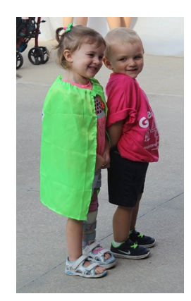
Make your team FUN! Show some NF spirit and express yourself with creative costumes and accessories.

Be sure to stay and win some of the fantastic raffle baskets (must be present to win) after the awards ceremony.