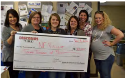
Driven to Care Illinois/Wisconsin Regional Team at NF Midwest in St. Charles