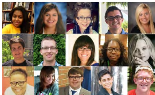
2016 Scholarship Recipients

Neurofibromatosis Midwest does not endorse any of the medications, treatments, or products reported in this newsletter. This information is intended only to keep our members informed. We strongly advise that you check any drugs or treatments mentioned with your physician.