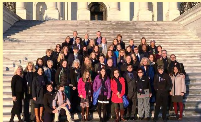
2017 Advocates on Capitol Hill

In February, volunteers once again went to the nation's capital going office to office raising awareness and asking for continued support of neurofibromatosis.