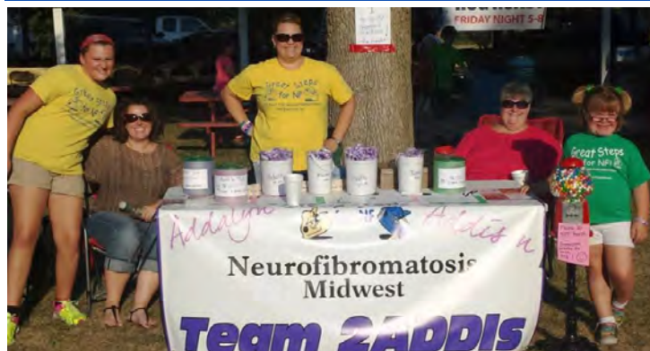
A booth at the Liberty Fall Festival by the 2ADDIS. They did it 4NF!