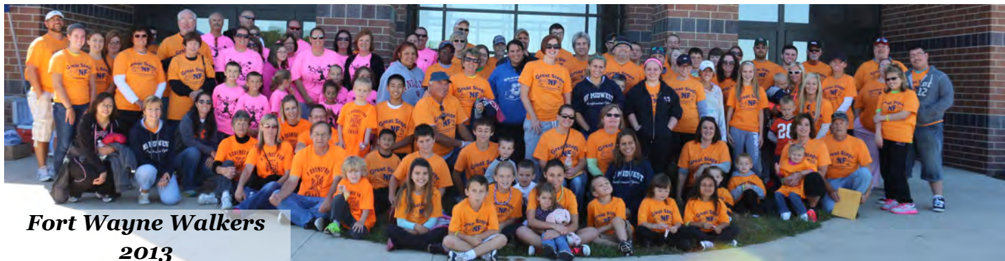
Fort Wayne Walkers 2013

Great Steps Fort Wayne — The 4th annual Great Steps for NF Walk will be held Saturday, September 13th at the Eel River Elementary School. Please sign-up early and show your support at www.greatsteps.org .