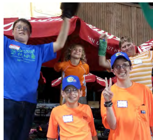
2013 Chicago area NF Family Day

Naperville Marathon —We had a wonderful turnout for the Naperville Marathon Run4NF team. Thanks to our spirited runners and fundraisers! PHOTOS