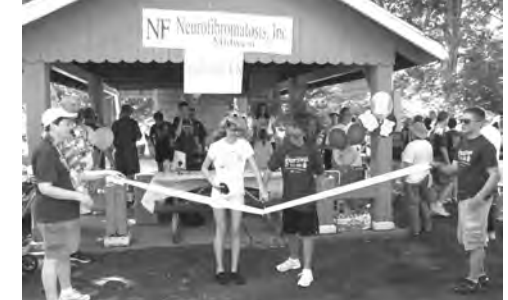
Effingham Top Winners