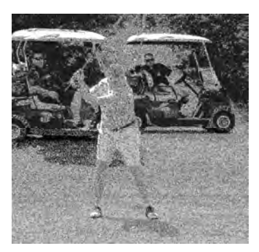
Not taking his eye off the ball this golfer takes a swing for neurofibromatosis!

holes were followed by a reception with silent auction and raffle.