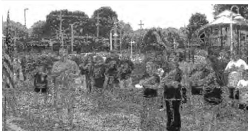
1st Annual Great Steps for NF Walk Kansas City

Great Steps for NF is a funtastic event for everyone to participate in. Mark your calendars for the 9th annual Great Steps walk in Naperville to be held June 5, 2010 and the 3rd annual Great Steps walk in Effingham to be held on June 19, 2010.