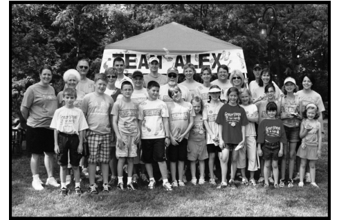
2008 walkers. Will you be in the 2009 photo?