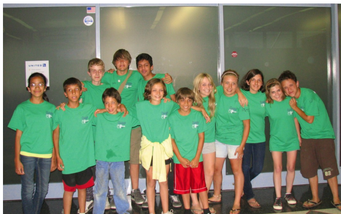
NF Midwest kids return triumphantly from camp.

If the site isn't up, please check back.